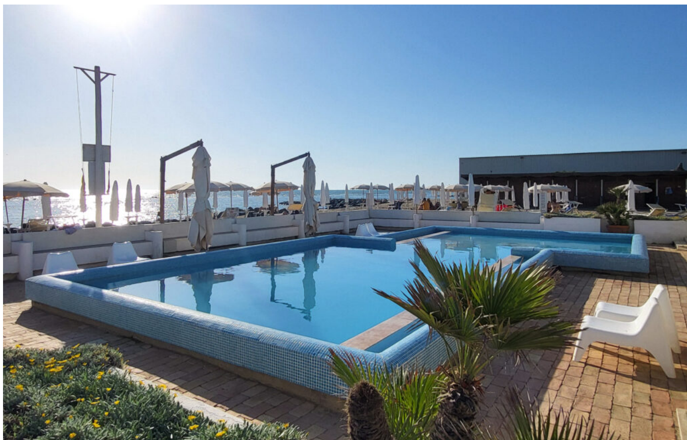
Children's pool of the "Capri" beach resort, in Fregene (Fiumicino, RM) - summer 2024