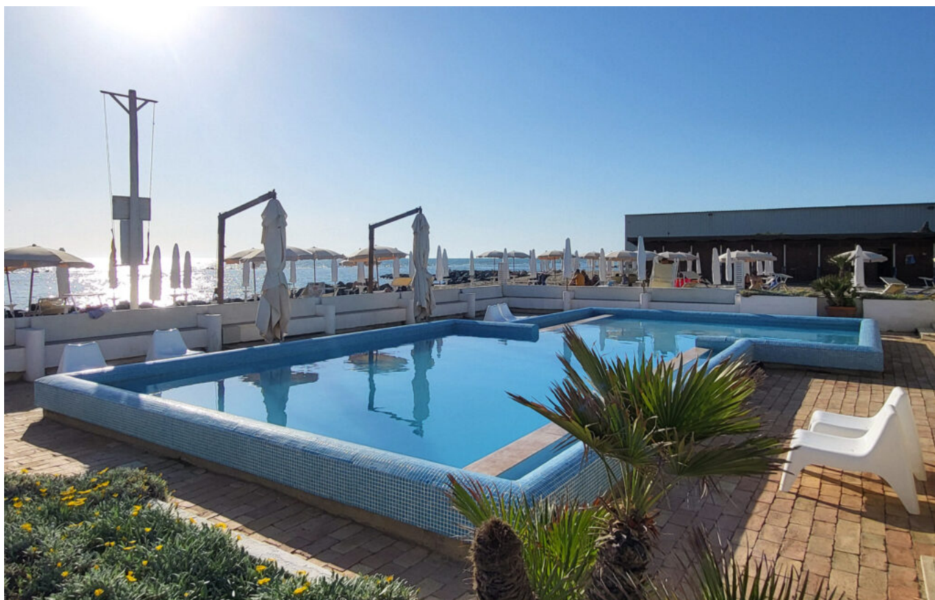
Children's pool of the "Capri" beach resort, in Fregene (Fiumicino, RM) - summer 2024